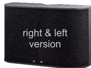
right & left version